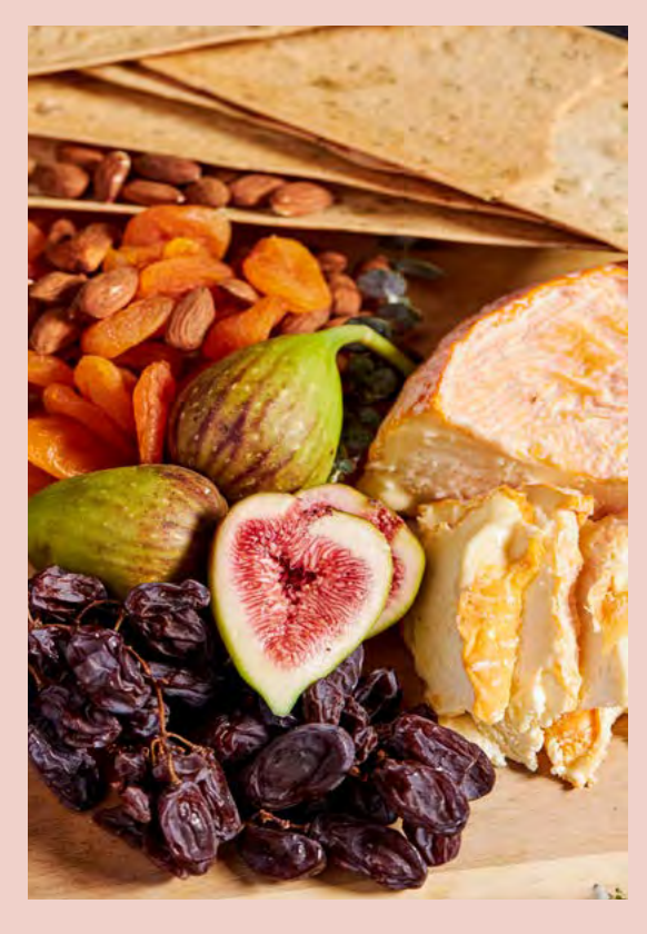
Cheese Board $170

Local and International Farmhouse Cheeses, Seasonal Fruits, Artisans Lavosh, Green Tomato Chutney, Dried Fruits and Nuts, Membrillo Paste