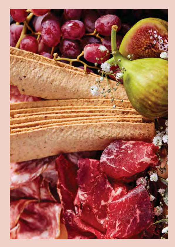
Antipasti Board $170

Local and International Farmhouse Cheeses, Seasonal Fruits, Artisans Lavosh, Green Tomato Chutney, Dried Fruits and Nuts, Membrillo Paste