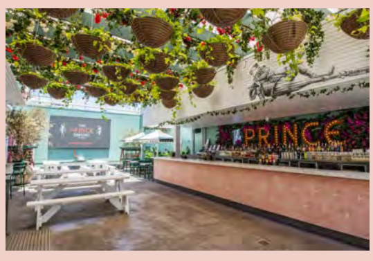
THE PRINCE CONSORT