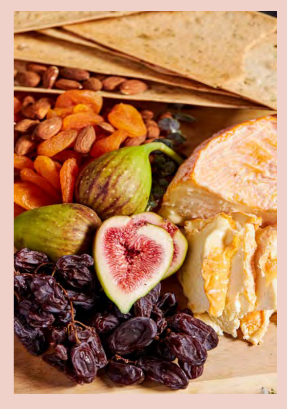
Cheese Board $170

Local and International Farmhouse Cheeses, Seasonal Fruits, Artisans Lavosh, Green Tomato Chutney, Dried Fruits and Nuts, Membrillo Paste