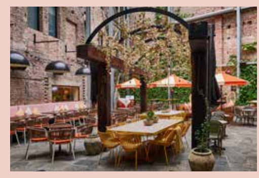
theluckyhotel.com.au | Newcastle